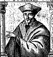
Scholar of Oxford